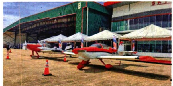
Antara pesawat ringan yang dipamerkan di SAS 2021 pada November lalu.

lah dipamerkan antaranya ialah jet komersial E195-E2 dari Embraer, T625 GÖKBAY dari Turkish Aerospace, Piaggio P-180 Avanti EVO dari Piaggio Aerospace dan Airbus Helicopters AS350 Ecureuil. Antara program lain sepanjang SAS2021 termasuk diskusi mengenai industri dan juga Hari Terbuka Edu pada 27 November untuk pelajar," katanya. Tambah Invest Selangor, edisi kedua