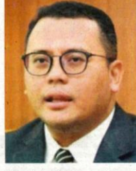
பொரிடம் இருந்து மானியத்தைப் பெற்றுக் கொண்டனர்.